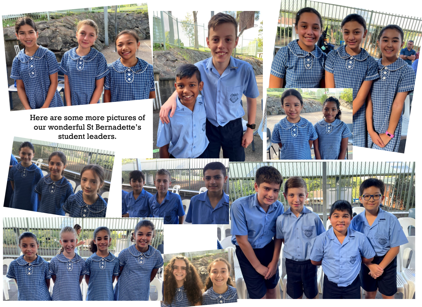
Here are some more pictures of our wonderful St Bernadette's student leaders.

Principal's address is at 10am, 11am and 12 noon. Bookings are essential, so please register on our website and for any covid-19 updates: www.oakhill.nsw.edu.au