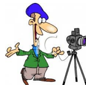
Photo envelopes have been sent home for individual and sibling photos. If you wish to purchase photos please order online and then forward envelope to class teacher. Please return all envelopes prior to photo day. Sibling photos will be taken at recess and lunchtime. A schedule will be placed in the newsletter next week. A reminder that all students will need to be in Full winter uniform on their photo day. If you need to purchase any items of uniform—please order via uniform order form on our website.